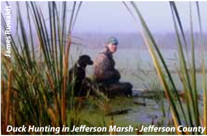
Duck Hunting in Jefferson Marsh - Jefferson County

WETLANDS INCREASE HUNTING, FISHING AND RECREATION SPENDING: 75% of Wisconsin's wildlife species depend on wetlands for some portion of their life cycle, including important game species such as deer, bear, ducks, geese, woodcock, pheasant, grouse, walleye, and northern pike. Communities that maintain healthy wetlands on public and private lands can realize a greater portion of the $3.8 billion dollars in annual retail sales and the 72,000 jobs associated with Wisconsin's hunting and outdoor recreation economy.*