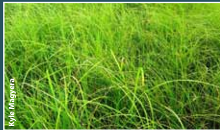
Water-loving plants, such as tussock sedge, are found in wetlands.

The best way to identify wetlands is to walk the site and look for physical clues. The photos below show common examples of wetland indicators. WDNR's Wetland Clues Checklist ( www.dnr.wi.gov/wetlands/clues.html ) provides a more comprehensive list of things to look for and may be useful to bring along during a site visit.