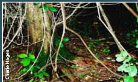
Shallow tree roots are indicators of wet conditions.