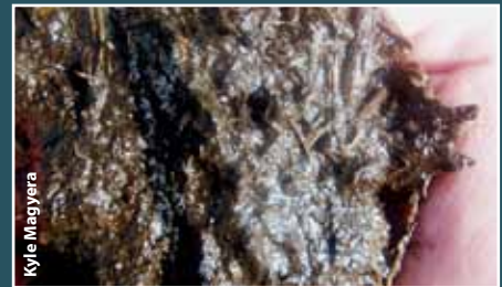
Prolonged saturation periods generate dark-colored soils in wetlands.