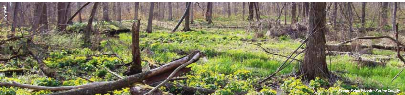
Renak-Polak Woods - Racine County