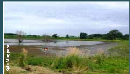
Low, wet spots and stunted, yellowing crops are good indicators of wetlands.